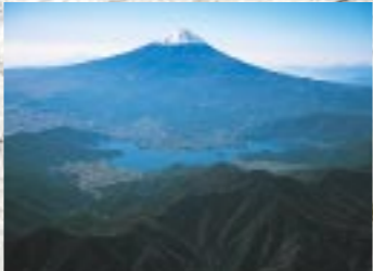
Fujikawaguchiko Town Lake Kawaguchiko