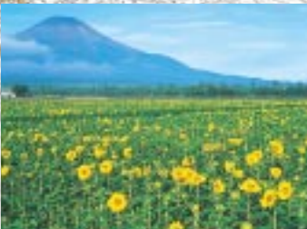
Yamanakako Village Hananomiyako-koen Park