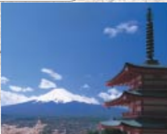
Fujiyoshida City Churei-to Pagoda