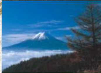
Nishikatsura Town Mt. Mitsutouge