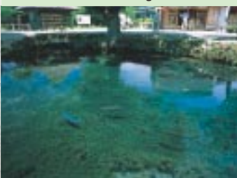
Oshino Village Oshino-Hakkai