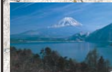
Minobu Town Lake Motosuko