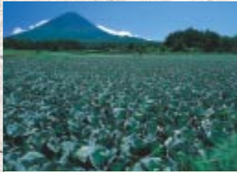
Narusawa Village Cabbage field